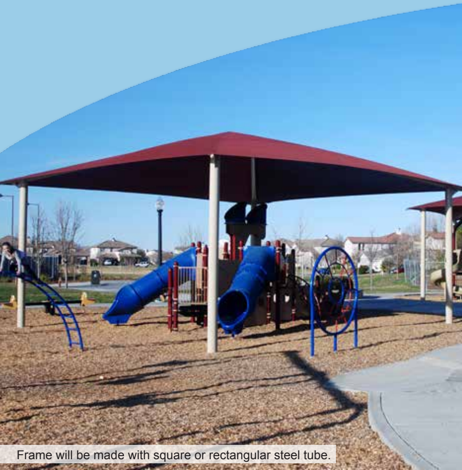
Frame will be made with square or rectangular steel tube.