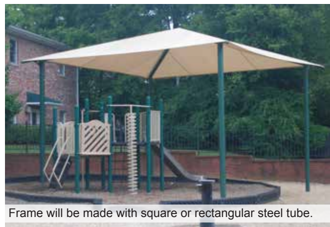
Frame will be made with square or rectangular steel tube.